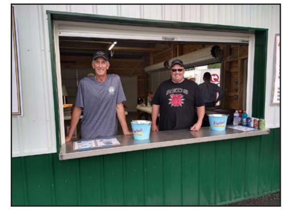
Sold Concessions at Waconia Rodeo